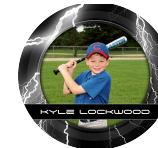
mirror, magnet or button